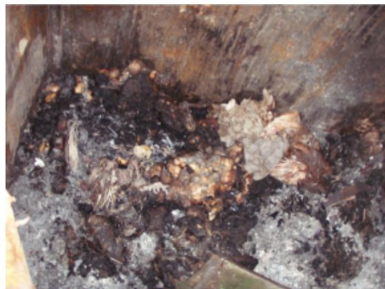
1. Burnt chickens in incinerator

During an investigation of the Wellington Egg Company Limited chicken farm at the start of August, officers observed piles of chicken wastes discharged to land beside local streams. Samples taken indicated high levels of faecal coliforms and nutrients in a drain at the farm and effects on water quality in the adjacent stream. Abatement notices have been issued to the landowners and the company to cease further unauthorised discharges at the property.