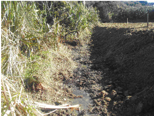
4. After remedial works were undertaken. Rhizomes visible.