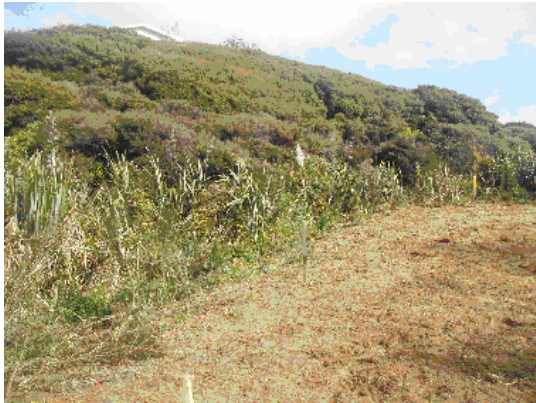
3. Before remedial works

These photos show the site before and after remedial works were undertaken. The after shot shows native bulrush rhizomes' emerging after fill material was removed.