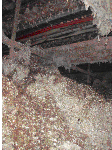
2. Piles of faeces leaching out of shed

An incident in Mohaka St, Wainuiomata involved a stream bank next to a new residential development. The developer recontoured and raised the bank of a tributary of Black Creek, no sediment control measures were put in place and works were undertaken without resource consent, resulting in sediment release to the stream. Greater Wellington issued an abatement notice to cease further sediment discharges. Since then the bank has been pulled back 5 metres from the stream. Hutt City Council has also been involved.