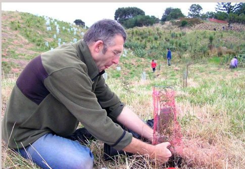
All concentration at the QEP Poplar Ave wetland planting on 23 May

Thanks to all our parks community groups for your tireless work in sourcing grants, planning, propagating, planting and ongoing support.