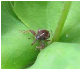
Flower weevil and non productive flowers above