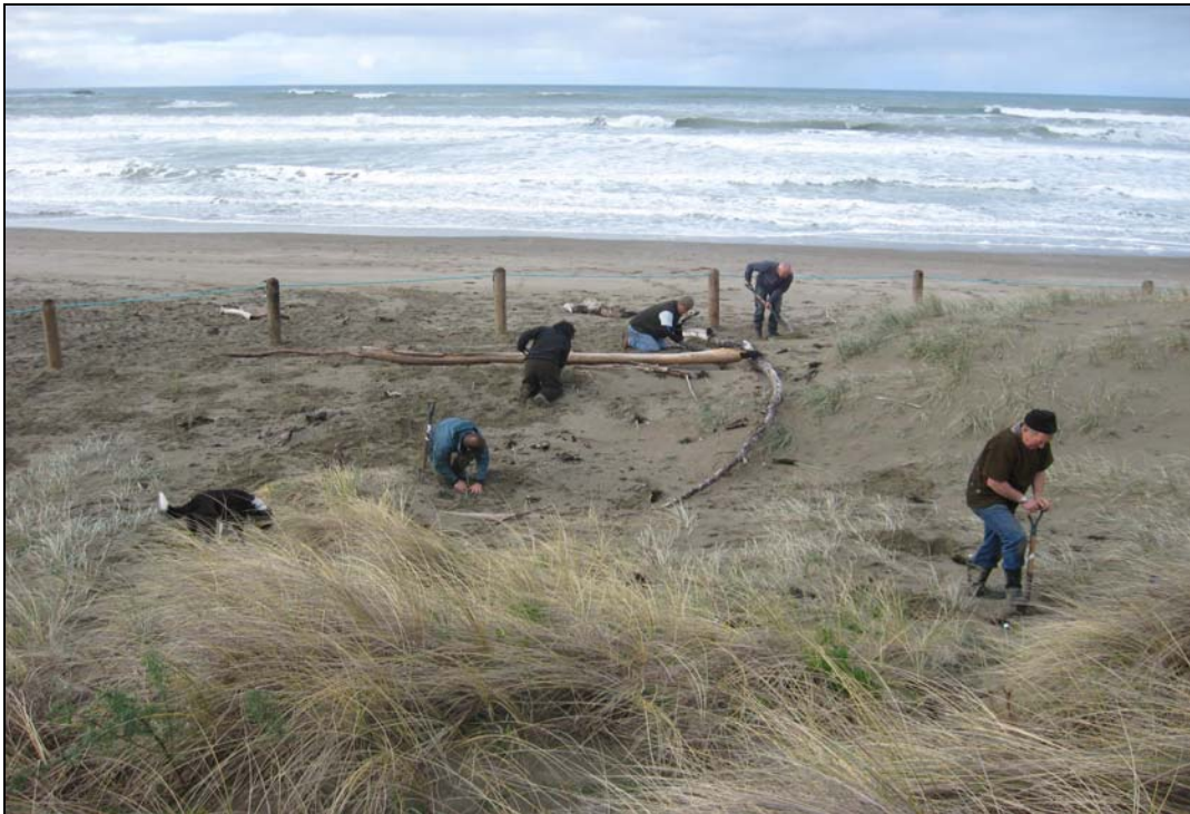
Figure 1. Riversdale, planting of dune vegetation as part of the effort to develop best practise guidelines for dune restoration