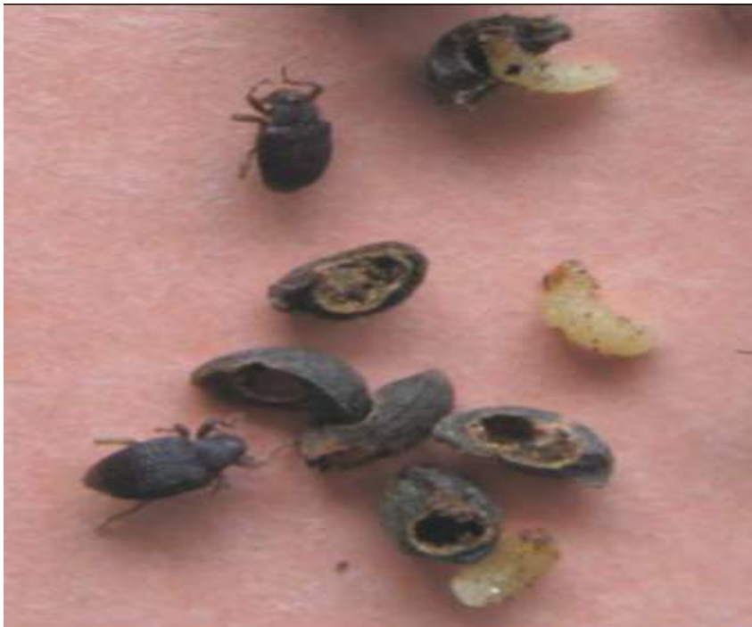
Seed Beetle larvae and adult

Darwin's barberry is still has limited distribution in Greater Wellington, and this proposal is targeting the weed before it generates significant costs here.