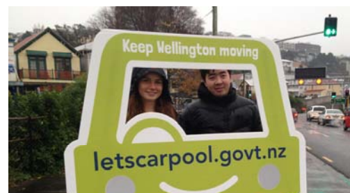
Figure 1 - Sandwich board

Z Energy was interested to support the campaign