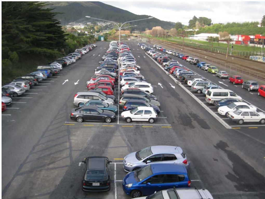
Fig. 1. The new park and ride carpark at Porirua Station