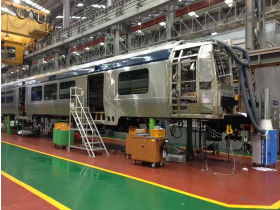
Fig. 2. The first Matangi 2 unit begins the outfitting phase at Hyundai-Rotem's Changwon factory in South Korea