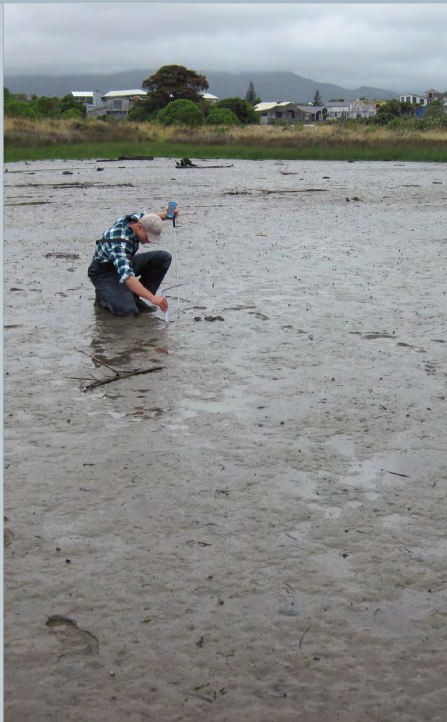
Sediment plate monitoring in Waikanae Estuary, Jan 2015.