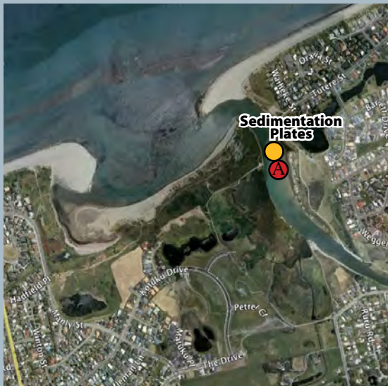
Figure 1. Location of intertidal sediment plates and fine scale monitoring site in Waikanae Estuary.