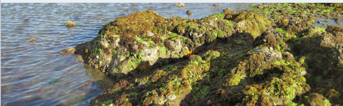
Moderate Gracilaria and Ulva biomass on rocks near Duck Creek.

The consistent presence of opportunistic macroalgae throughout the estuary since 2008, and the presence of high density intertidal macroalgal growths (that in some years have been on the verge of causing nuisance conditions) shows nutrient inputs to the estuary are sufficient to maintain elevated growths of macroalgae.