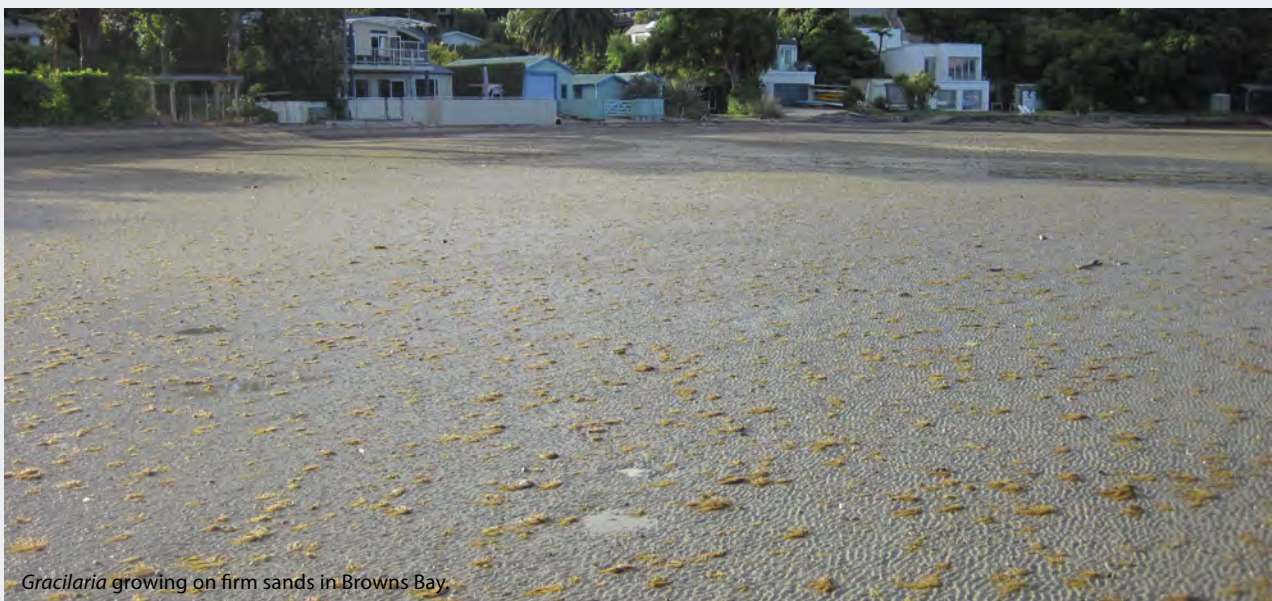
Gracilaria growing on firm sands in Browns Bay

*N.B. Only the lower EQR of the 2 metrics, AA or AA/AIH should be used in the final EQR calculation.