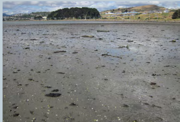
Low Gracilaria biomass (low cover) west of Porirua Stream delta.