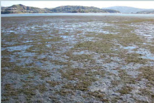
Moderate Gracilaria biomass (high cover) near Horokiri Stream.

The overall opportunistic macroalgal Ecological Quality Rating (EQR) for Porirua Harbour was 0.58, a quality status of "MODERATE" (Table 2). This rating was driven primarily by the widespread presence of macroalgae throughout most of the estuary - an affected area quality status of "BAD". This score was moderated by the "GOOD" quality status of macroalgal percentage cover and biomass, and "HIGH" quality status (general absence) of algal entrainment in underlying sediments. The absence of gross eutrophic zones in the estuary was reflected in a quality status of "HIGH".