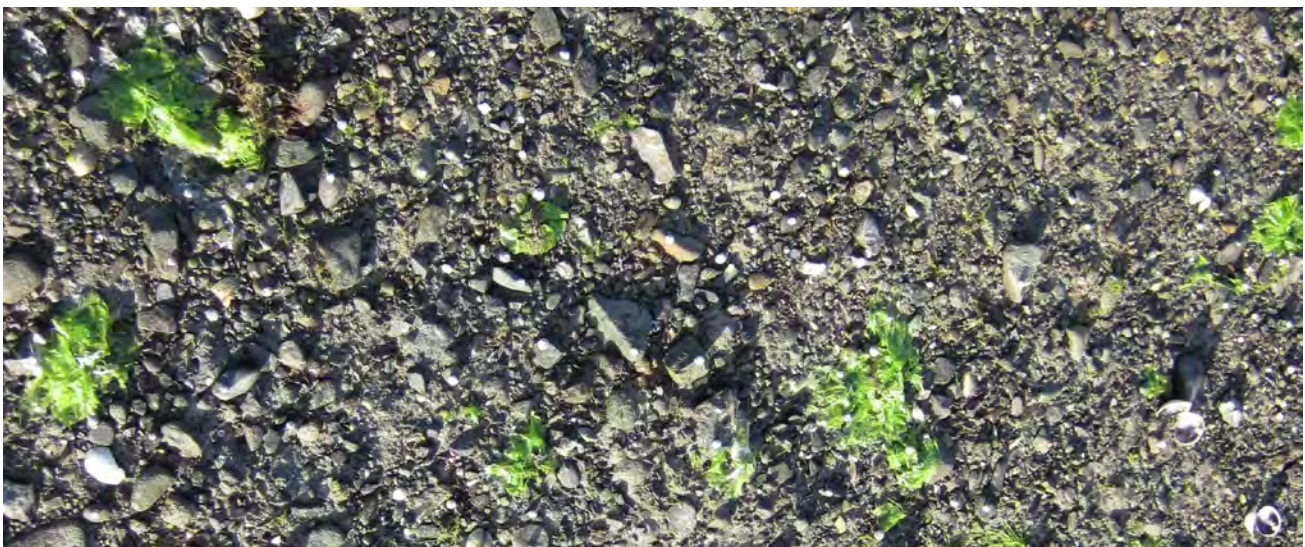
Sparse growths of Ulva lactuca along the intertidal flats adjacent to Porirua Stream.