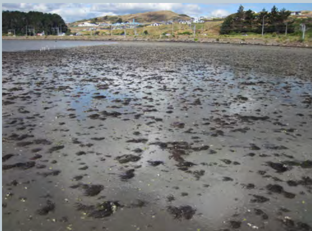
High Gracilaria biomass (moderate cover) east of Porirua Stream.