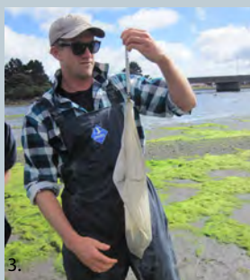
Measuring algal biomass: 1. collect macroalgae from quadrat, 2. place in mesh bag and squeeze out free water, 3. weigh.