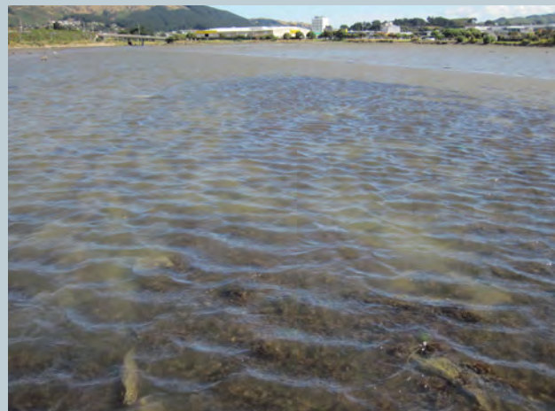
Very high subtidal Gracilaria biomass in the lower Porirua Stream.