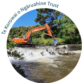
Removing existing barriers

How a fish passage barrier is fixed will depend on the species present, and what ability they have to move through the waterway. It will also need to be site-specific to ensure the solution will work in specific locations.