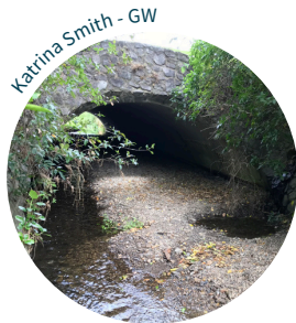
Hydraulic and stream simulation design culverts