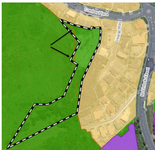
Figure 7. 9 Comber Place – WCC PDP zoning and Hilltops and Ridgelines Overlay (arrows identify small portions of the site referred to in this report)