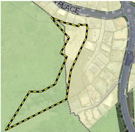
Figure 6. 9 Comber Place - WCC ODP zoning