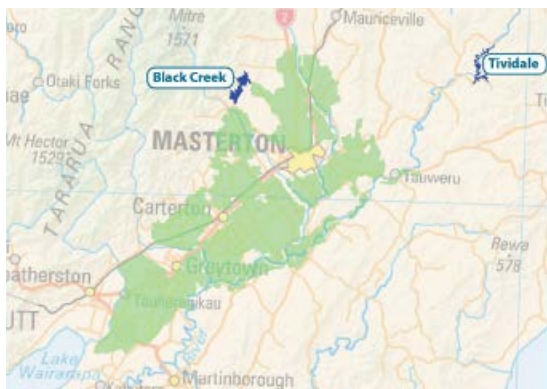
Water Wairarapa's proposed water storage (blue) and indicative water supply areas (green).

The question of how to increase the reliable supply of water through storage has been considered in Wairarapa for several decades.